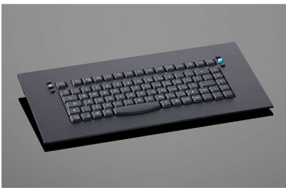
DS86W Front Panel

We offer this keyboard in different variants. Are you interested in any of the following solutions? Just get in touch with us.