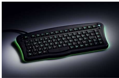
DS86W with Backlight